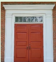
Freshly Painted Front Doors!