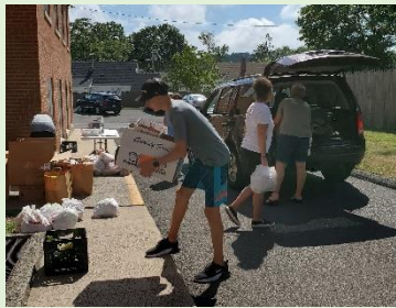
Thrift Store Back to School